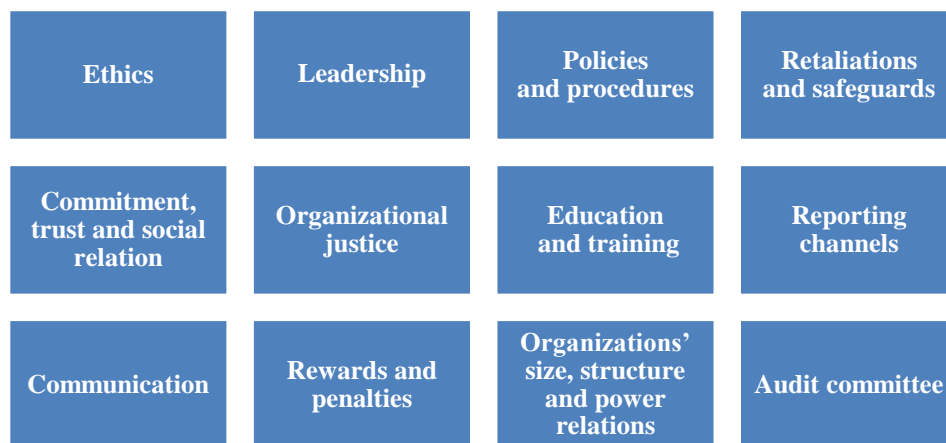
Figure 2. Framework: Areas important for supporting internal whistleblowing